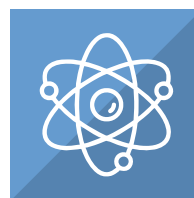
Science and Technology