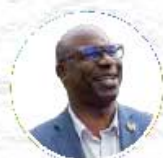
CONGRESSMAN J. BOWMAN, ED.D. New York, USA